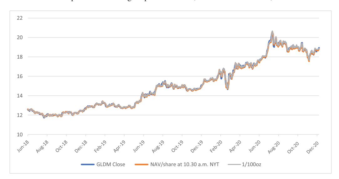
Share prive & NAV v. gold price - June 26, 2018 to December 31, 2020

Investing in the Shares does not insulate the investor from risks, including price volatility. The following chart illustrates the movement in the market price of the Shares and NAV of the Shares against the corresponding gold price (per 1/100 of an oz. of gold) since the day the Shares first began trading on the NYSE Arca: