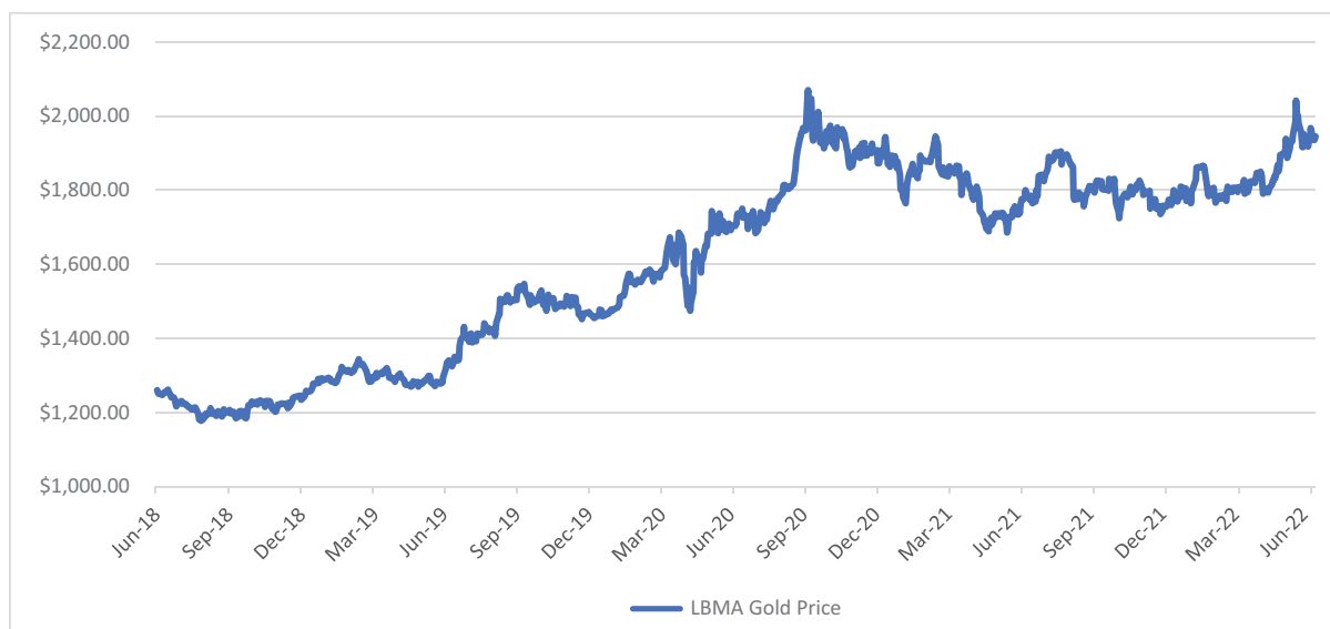
Daily Gold Price - June 26, 2018 to June 30, 2022 LBMA Gold Price PM USD

The average, high, low and end-of-period gold prices for the three and twelve-month periods over the prior three years and for the period from June 26, 2018 (the first date the Shares began trading on the NYSE Arca) through June 30, 2022, based on the LBMA Gold Price PM, were: