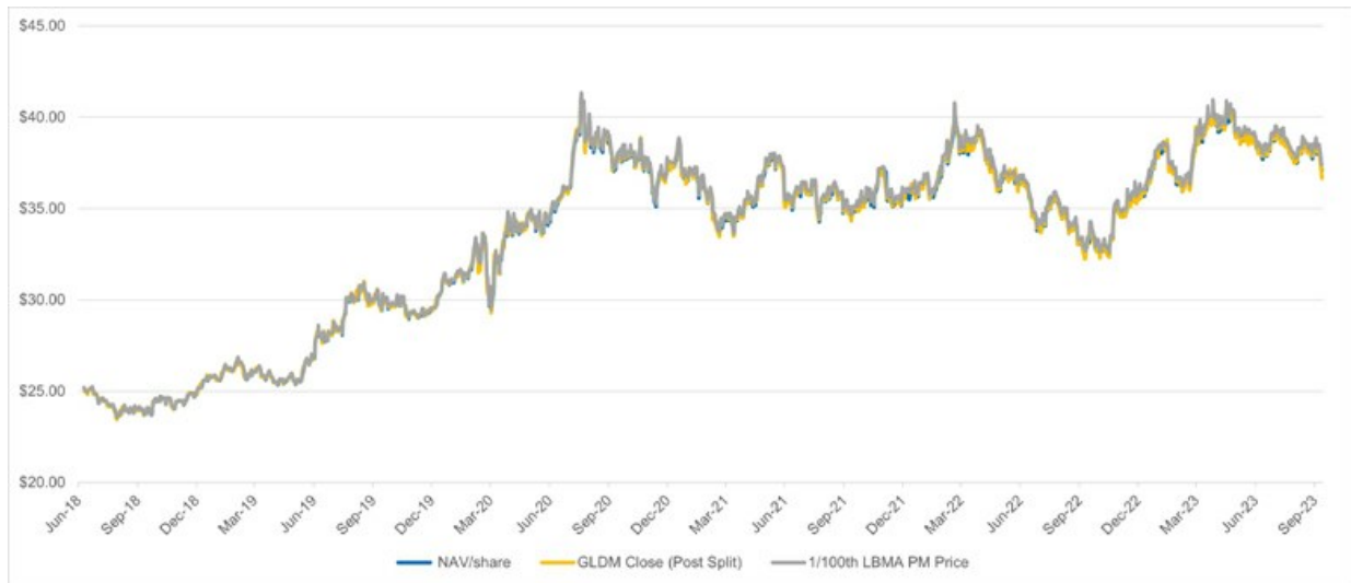
Share price & NAV v. gold price—June 26, 2018 to September 30, 2023

Investing in the Shares does not insulate the investor from risks, including price volatility. The following chart illustrates the movement in the market price of the Shares and NAV of the Shares against the corresponding gold price (per 1/100 of an oz. of gold) since the day the Shares first began trading on the NYSE Arca: