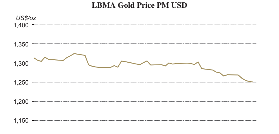
Daily gold price - April 1, 2018 to June 30, 2018

The average, high, low and end-of-period gold prices for the periods from January 30, 2017 through June 30, 2018 and for the period from the Date of Inception through June 30, 2018, based on the LBMA Gold Price AM were: