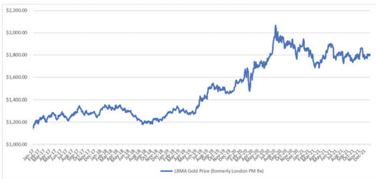
Daily Gold Price – January 1, 2017 – December 31, 2021 LBMA Gold Price PM USD

The average, high, low and end-of-period gold prices for the three and twelve-month periods over the prior three years and for the period from the Date of Inception through December 31, 2021, based on the LBMA Gold Price PM when available from March 20, 2015 and previously the London Fix, were: