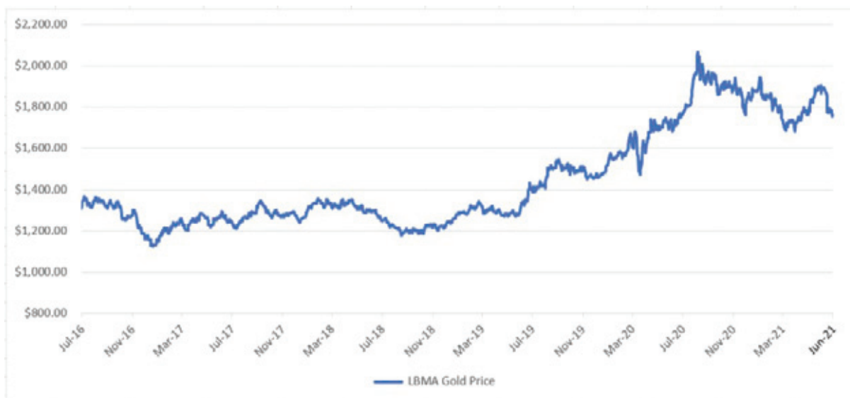
Daily Gold Price – July 1, 2016 – June 30, 2021 LBMA Gold Price PM USD

The average, high, low and end-of-period gold prices for the three and twelve-month periods over the prior three years and for the period from the Date of Inception through June 30, 2021, based on the LBMA Gold Price PM when available from March 20, 2015 and previously the London Fix, were: